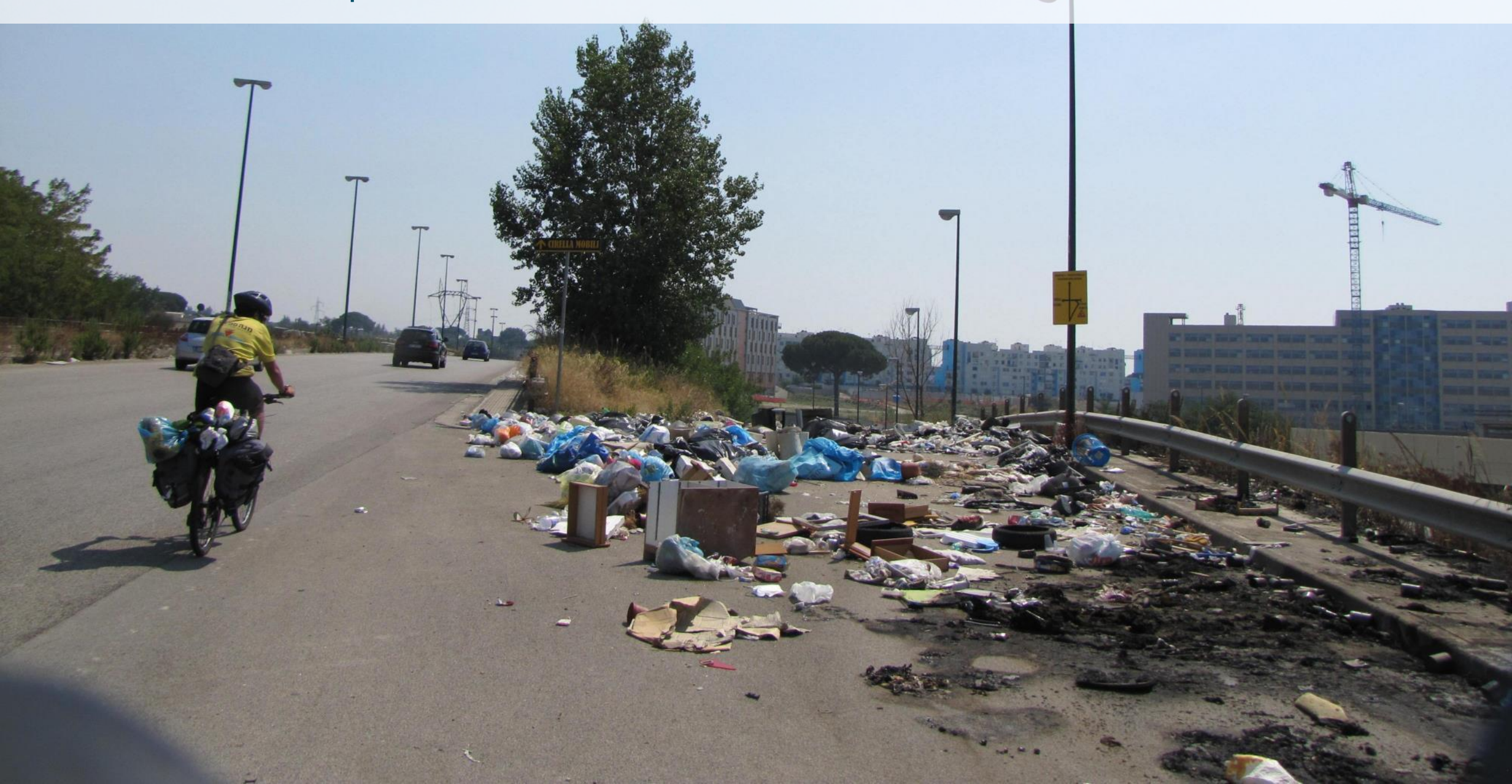
Landscape/area: monotonous/unattractive; Noise / dust / smell